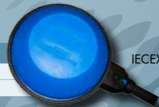
IECEX Float Switch