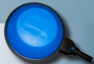
IECEX Float Switch